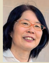
Kuroda Nobu Cultural Landscape