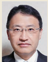
Takizawa Makoto Japanese Archaeology