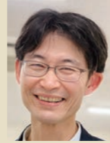
Ito Hiromu Development / Tourism Planning