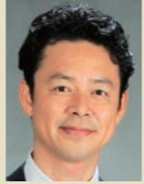
Shimoda Ichita Architectural Heritage