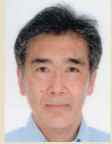
Yagi Haruo History of Eastern Art