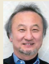
Matsui Keisuke Geography of Culture and Tourism