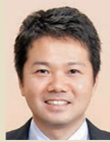
Take Masanori Ecotourism